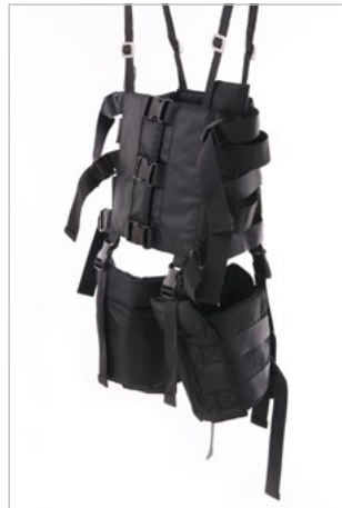
Universal suspension harness S-M-L-XL

Eleveo helps to maintain proper posture, reduces load, eliminates balance problems and improves motor coordination training. Unique harnesses are designed for uni- or bilateral support of the body as well as for a gradual level change from fully loaded to fully unloaded. The device allows for a manual controlled treatment of lower limbs and pelvis to ensure proper movement. Configurability of the device allows the clinics to treat various patients with a single Eleveo system. Extra options help to adjust the system to specific needs of each patient.